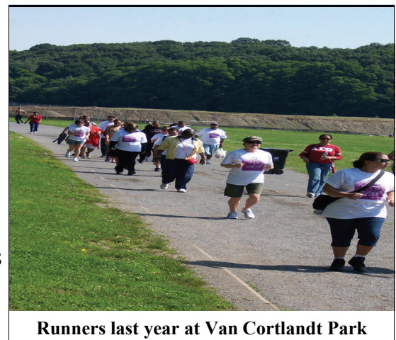
Runners last year at Van Cortlandt Park

Meeting location: Montefiore Medical Center 111 East 210th Street—Take Central Pavilion elevators to the 4th floor, room 429