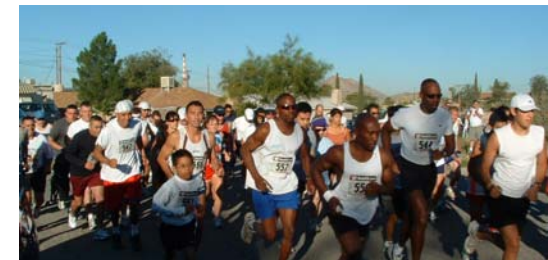
Road To Recovery 8K — 2004